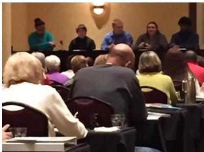
Panel of Former Foster Youth

What a great Nebraska State CASA Conference! We heard from several wonderful speakers and a great panel of youth and we just wanted to share some of their insight with you.